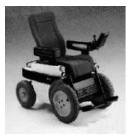
Fig. 1. An example of modern electric-powered wheelchairs.

The extreme difficulty with which persons with severe disabilities have been taught to manoeuvre a power wheelchair is an example of difficult interaction with AT: 9 to 10% of patients who receive power wheelchair training find it extremely difficult or impossible to use the wheelchair for activities of daily life; 40% of patients reported difficult or impossible steering and manoeuvring tasks; 85% of clinicians reported that a number of patients lack the required motor skills, strength, or visual acuity. Nearly half of patients unable to control a power wheelchair by conventional methods would benefit from an automated navigation system. These results indicate a need, not for more innovation in steering interfaces, but for entirely new technologies for supervised autonomous navigation [18].