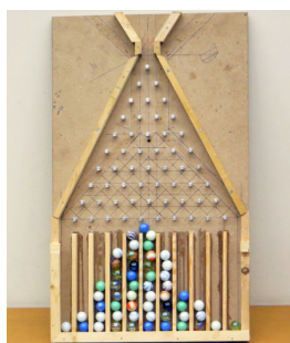
Figure 1: A Galton board

In this programming assignment you will have to write a program to simulate a Galton board , a.k.a. Galton box , quincunx or bean machine, a device used to illustrate the central limit theorem, in particular, that with sufficiently large sample the binomial distribution is approximated by the normal distribution. The device consists of a vertical board with interleaved rows of pegs. A large number of small balls falls from the top, their path to the bottom of the board bouncing left and right when the balls hit the pegs. The bottom of the board collects balls that will follow the binomial distribution (see Figure 1).